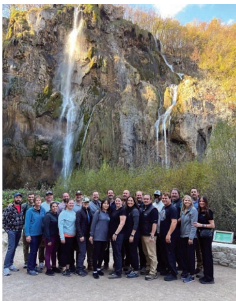
Class 51 in front of a waterfall at Plitvice Lakes National Park, Croatia

To learn more about Scott's international trip, visit the Class's blog at https://class51internationaltrip.wordpress.com/ .